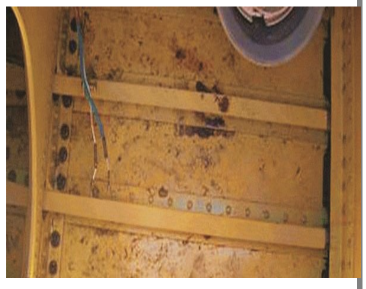
The brown-black debris on the bottom of this tank is made up of fungus and bacteria. This growth can clog fuel filters causing the airplane fuel quantity indication system to read incorrect values, and eventually cause structural corrosion of the aluminum stringers and wing skin.

As a result, the most common method for water ingress into an aircraft is through condensation. Water vapor settles from the air space above the liquid fuel and sinks to the low spot in a tank, whereupon it can be removed.