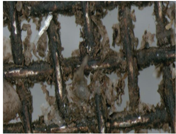
This filter screen is contaminated with particulates and a gum residue.

For aircraft with multiple tanks, there are multiple probes and measuring units. Balancing the fuel load is aided by gravity and/or pumps. Multiengine aircraft have redundant lines, hoses and valves to ensure supply to each engine. Fuel tanks need to be vented to allow air in and prevent a vacuum, but they also need a check valve to prevent siphoning. Each component needs to be both functioning properly and free from defect. as the smallest leak can allow air into the system, which can result in a flameout. In addition, many aircraft have pressure refueling valves and both check- and shut-off valves to prevent over pressurization of the fuel tanks. For many large aircraft, there is a mechanical backup system where a dipstick can be dropped in the tank to measure fuel.